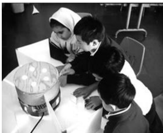
Working with the Round Light Source

Once the children are comfortable using their mirrors, I give them new tools to use, such as prisms. Prisms allow the children to explore what happens when light is bent. It's a magical event when we learn how to make rainbows!